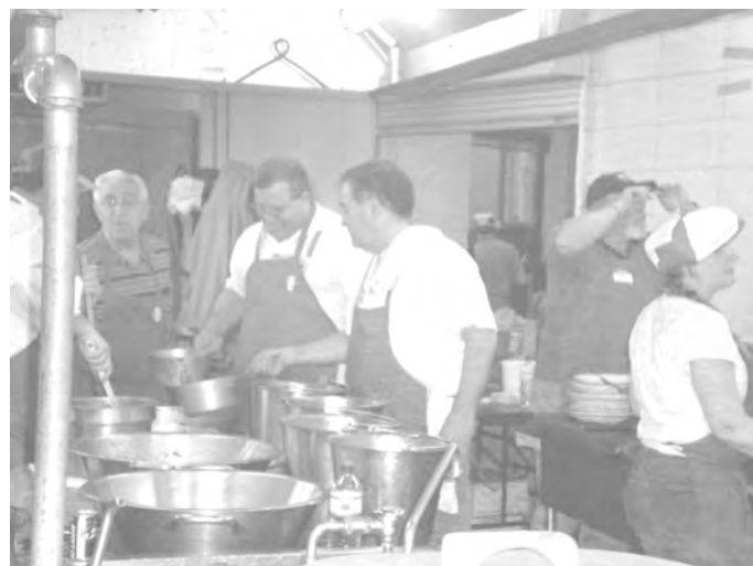
In la cucina, a good number of helpers kept things moving along for all the long hours needed to make a huge number of us wanting a good Italian meal very happy.

By providing a means of good eating with culinary style, but simultaneously showing an amazing cooperation by diverse sections of our society, it is hoped that this universalized activity spurs others to follow this unselfish and uplifting example for the benefit of our entire community.