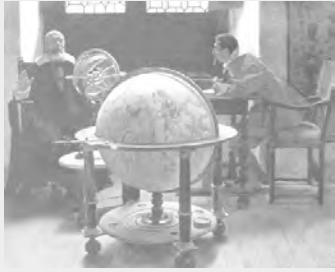
Galileo answering a student's questions.