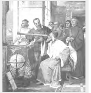
Galileo giving a demonstration to the Venetian Dode.

In 1592, when he was 28, Galileo was given a position as mathematician at the University of Padua, lecturing on a wide array of subjects such as geometry, astronomy, mechanics, fortifications, surveying, and optics. He invented a horse-driven pump to raise water. While in Padua, he met Marina Gamba and they had three children together.