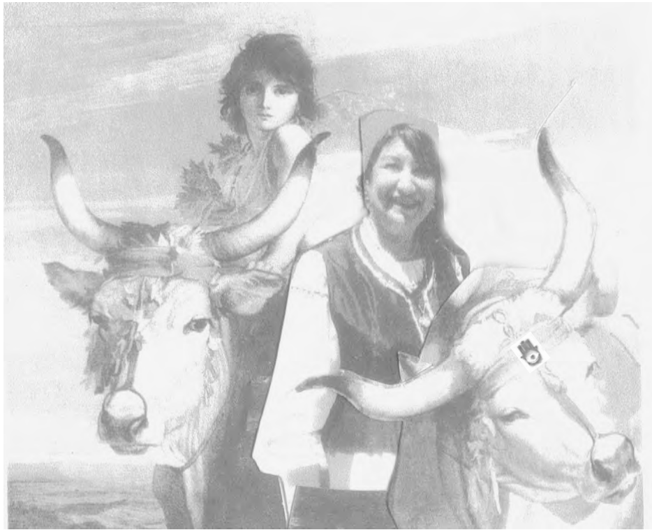
Ermine and la Strega dell'Crepuscolo , Amalasunta, in a festival procession.

Pulling himself together after these traumas, Ron returns to the house as Er-