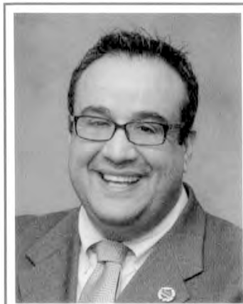
Owned And Operated By NRT LLC.