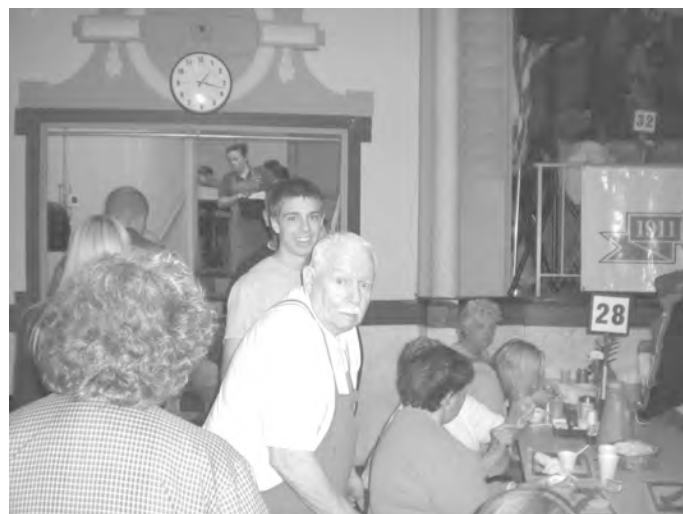
Veterans and grandsons were at the ready to serve the crowds.